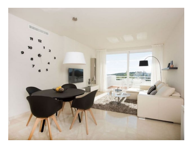
= 3 Bedrooms