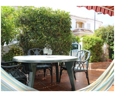
= 3 Bedrooms