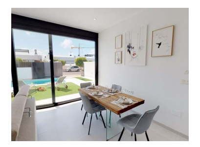
= 3 Bedrooms